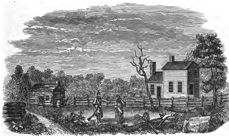
Red Jacket's House, Seneca Village. Residence of Jones, the Interpreter.