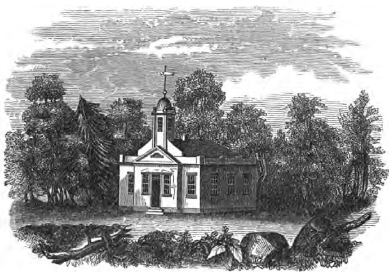
SENECA MISSION CHURCH, Seneca Village, Western View.